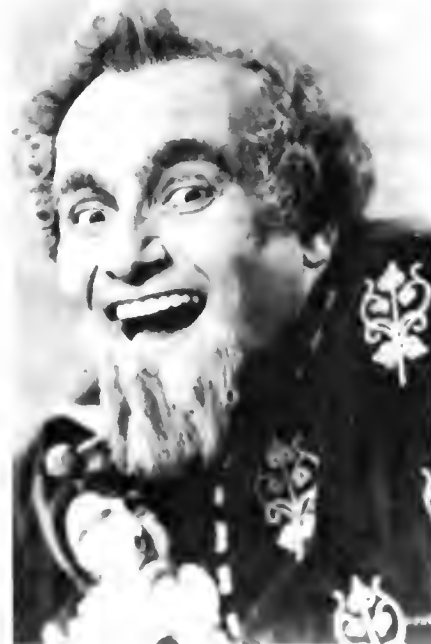
Leonard Warren in the title role of Verdi's Rigoletto